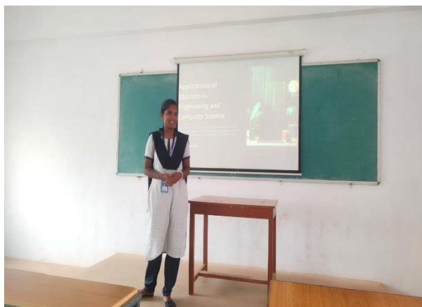
Surampalem, Andhra Pradesh, India 33M3+8V4, Surampalem, Andhra Pradesh 533437, India Lat 17.0836° Long 82.054664° 30/05/24 10:58 AM GMT +05:30