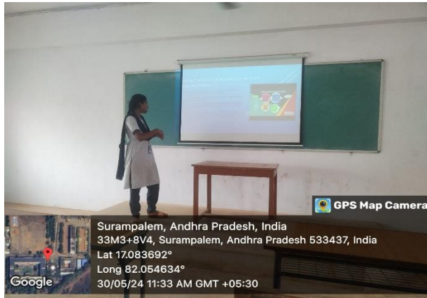
Surampalem, Andhra Pradesh, India 33M3+8V4, Surampalem, Andhra Pradesh 533437, India Lat 17.083692° Long 82.054634° 30/05/24 11:33 AM GMT +05:30