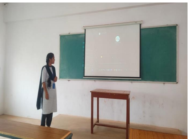
Surampalem, Andhra Pradesh, India 33M3+8V4, Surampalem, Andhra Pradesh 533437, India Lat 17.0836° Long 82.054664° 30/05/24 10:41 AM GMT +05:30