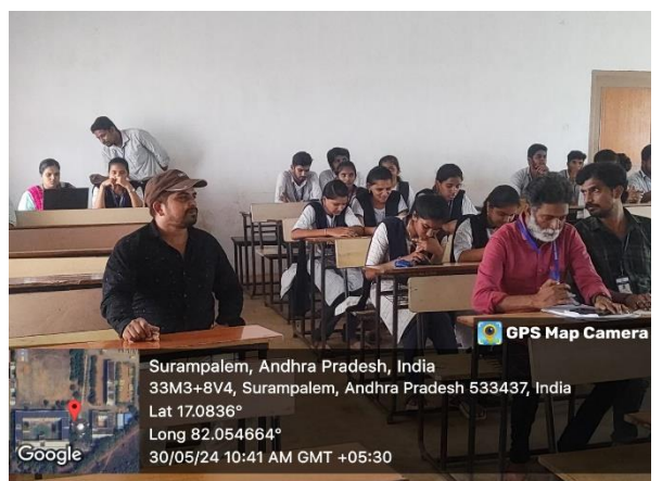
Surampalem, Andhra Pradesh, India 33M3+8V4, Surampalem, Andhra Pradesh 533437, India Lat 17.0836° Long 82.054664° 30/05/24 10:41 AM GMT +05:30