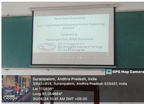
Surampalem, Andhra Pradesh, India 33M3+8V4, Surampalem, Andhra Pradesh 533437, India Lat 17.0836° Long 82.054664° 30/05/24 10:41 AM GMT +05:30