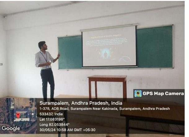
Surampalem, Andhra Pradesh, India 1-378, ADB Road, Surampalem Near Kakinada, Surampalem, Andhra Pradesh 533437, India Lat 17.083198° Long 82.053844° 30/05/24 10:58 AM GMT +05:30