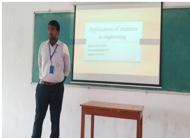
Surampalem, Andhra Pradesh, India 33M3+8V4, Surampalem, Andhra Pradesh 533437, India Lat 17.0836° Long 82.054664° 30/05/24 10:41 AM GMT +05:30