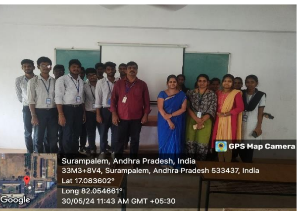
Surampalem, Andhra Pradesh, India 33M3+8V4, Surampalem, Andhra Pradesh 533437, India Lat 17.083602° Long 82.054661° 30/05/24 11:43 AM GMT +05:30