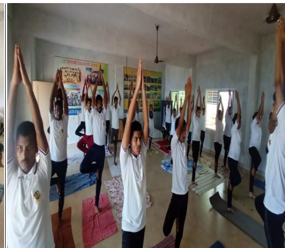
Students in Yoga Practice