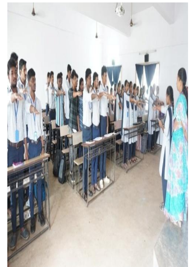
Anti Drug awareness Pledge in class rooms