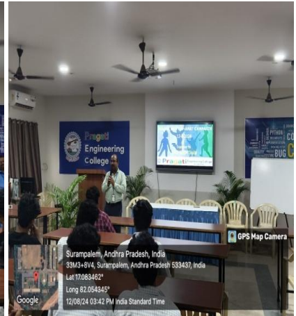
NSS PO speaking to students