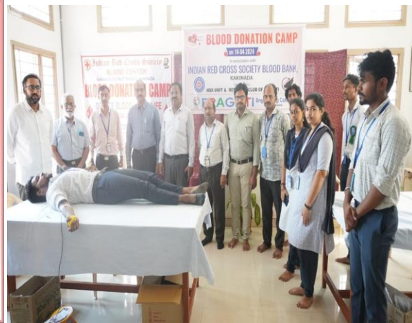
Blood Donors, Volunteers and Medical team in Blood Donation Programme