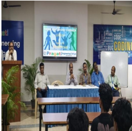
Controller of exams & Director Academics Speaking to students on Ethics