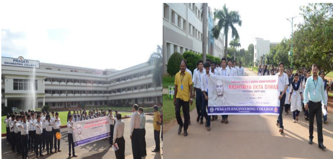
NSS Students in Unity Day rally