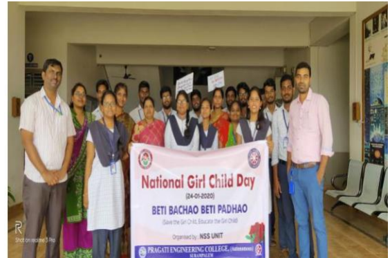
Volunteers in Group Photo