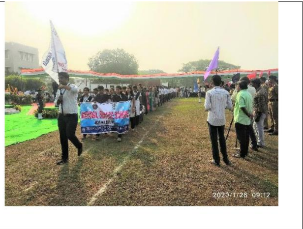
NSS Volunteers in March Fast