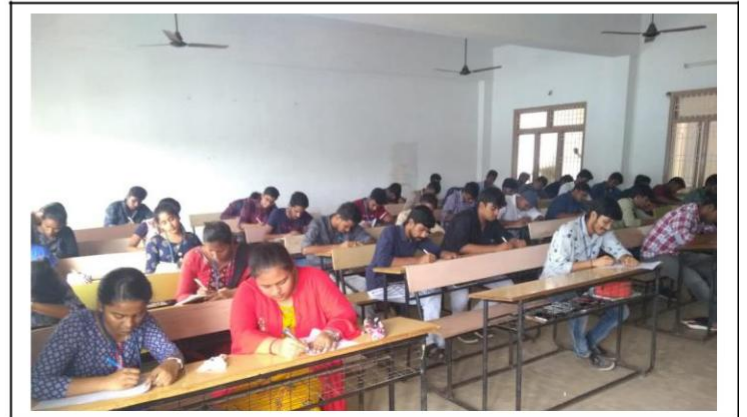
Students participating in NSS Day celebrations and receiving certificates