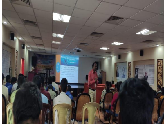
NSS Voluteers attending Conference