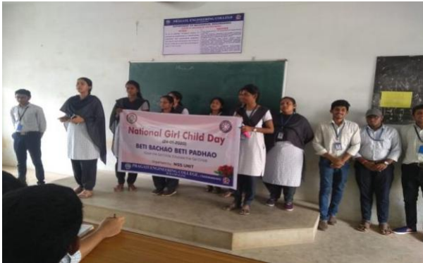
NSS Volunteers awareness on Girl Child Day

On this day we have educated many students about many issues that are going in the society, women in every field and women empowerment. This is a joint initiative of Ministry of Women and Child Development, Ministry of Health and Family Welfare and Ministry of Human Resource Development.