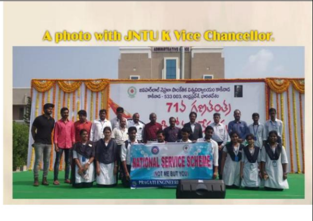
NSS Volunteers in Group photo with Vice Chancellor