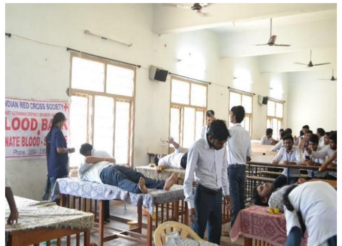
Students in Blood Camp