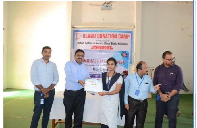
Students receiving participation certificate