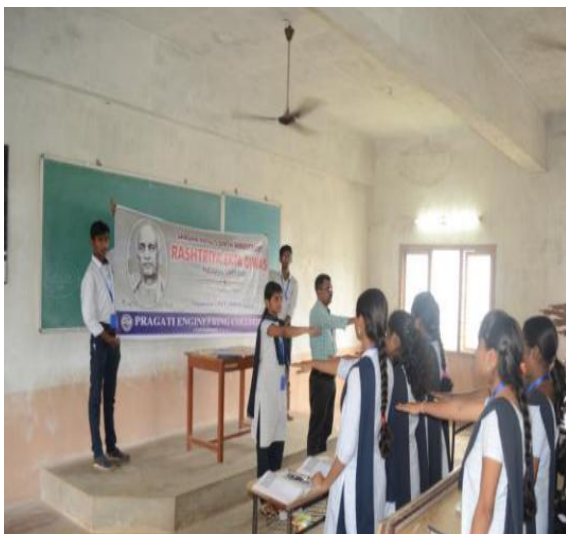
Unity Day Pledge

On 31 st October, the college NSS Unit along with the college NCC & Sports Unit, organized Mass Pledge-Rashtriya Ekta Diwas Pledge, Unity Day walk in the campus, Drawing Competitions-Theme: National Unity and Solidarity and Indoor Games to the students.