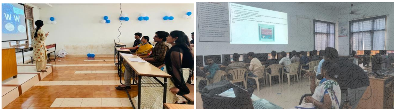
Photos of the event of PPT and Poster organized in ECE Block