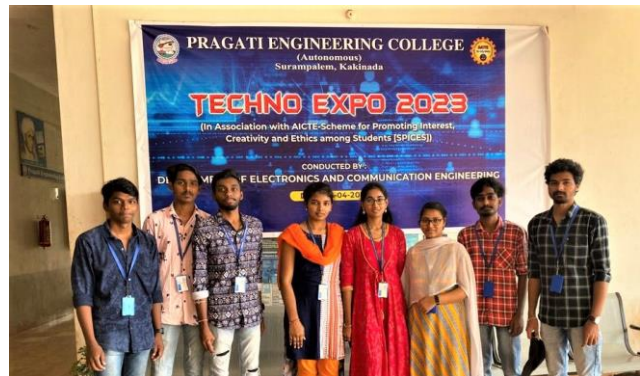
Photos of the Techno Expo-2k23 at ECE block