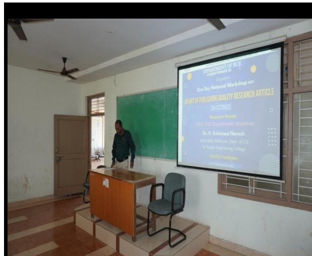
Photos of the One-day workshop at EG-3 room ECE Block