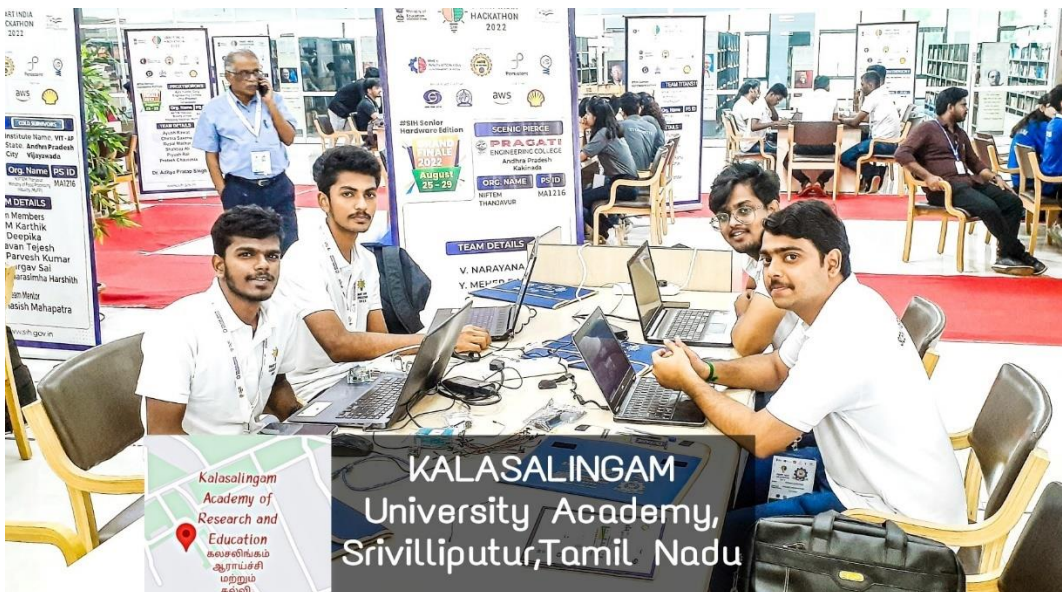
Team Scenic Pierce at Kalasalingam University, Srivilliputur, Tamil Naidu