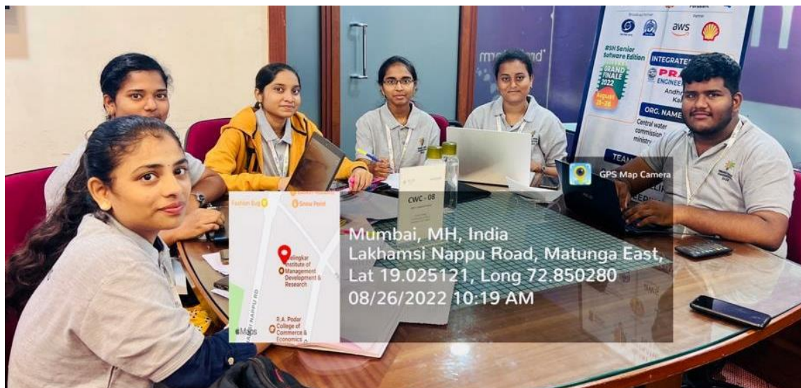
Team Integrated Forming at Mumbai, Maharashtra