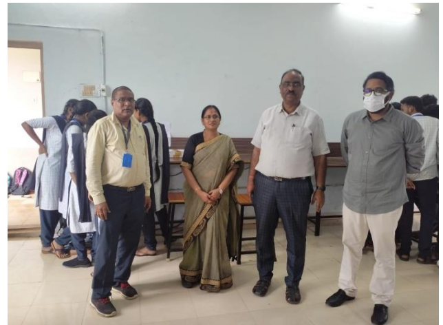
Photos of the Techno Expo-2k22 at ECE block