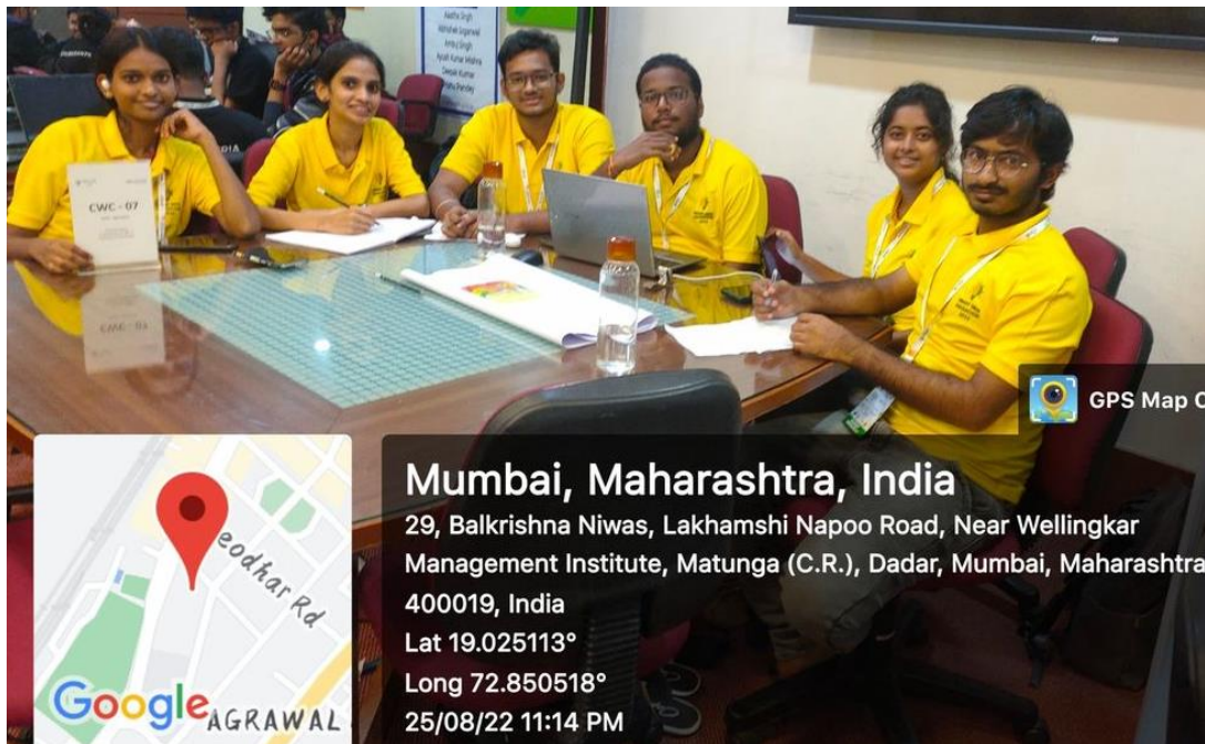
Team Agro Family at Wellingkar Management Institute, Mumbai, Maharashtra