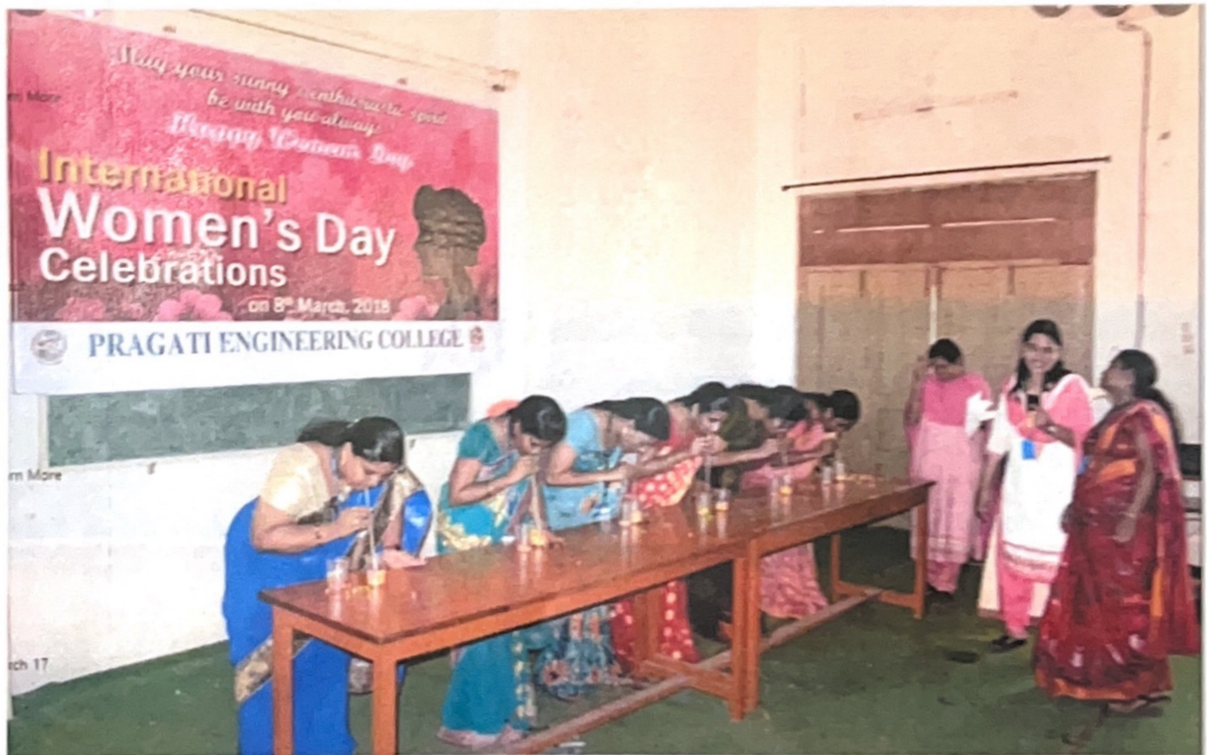
Conducted Programs for Women Faculty on International Women's day on 8 th March 2018