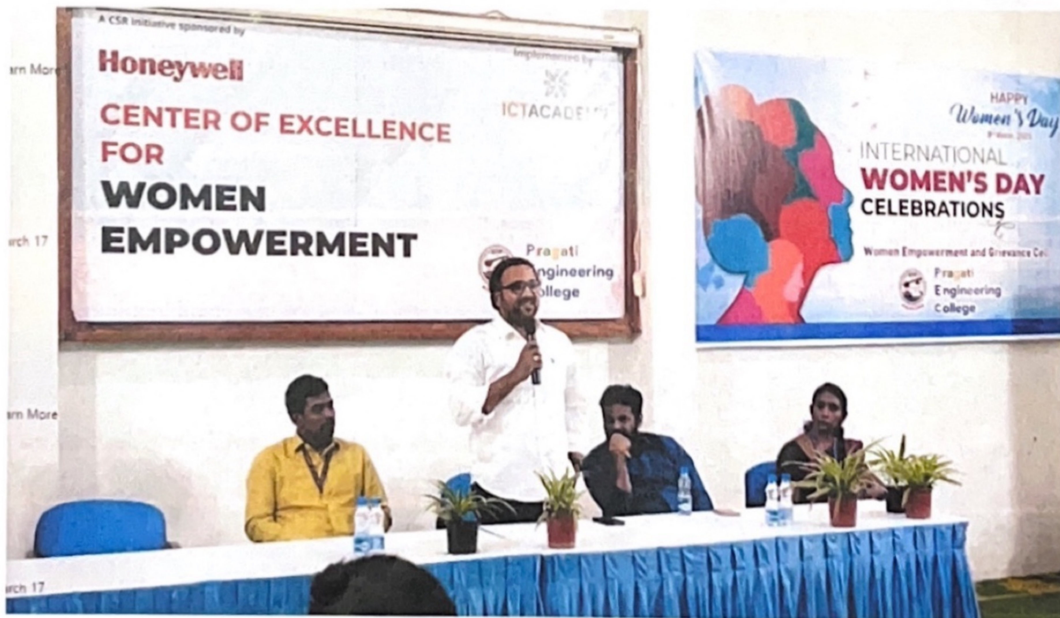
Inaugurated Center of Excellence for Women Empowerment by Honeywell on eve of International Women Day

The Women Empowerment and Grievance Cell (WEGC) actively organizes awareness initiatives for women. Annually, WEGC commemorates International Women's Day, inviting notable speakers to address both students and staff. Engaging activities, including games, are held during this event, fostering a supportive and empowering environment.