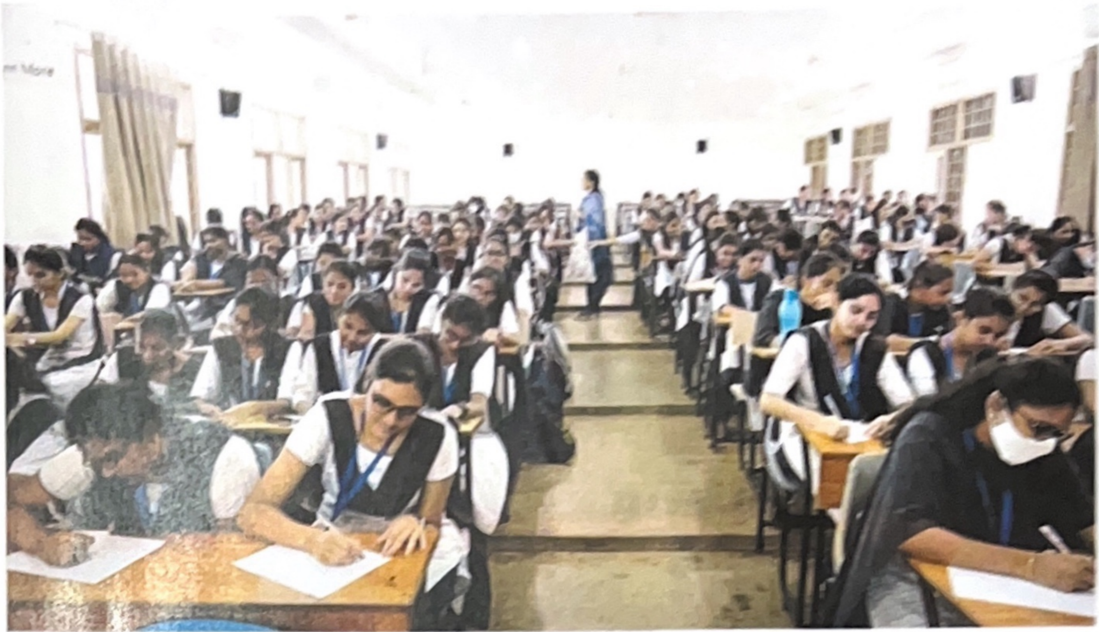
Conducted Essay writing Competition on "How can We Promote Gender Equality"