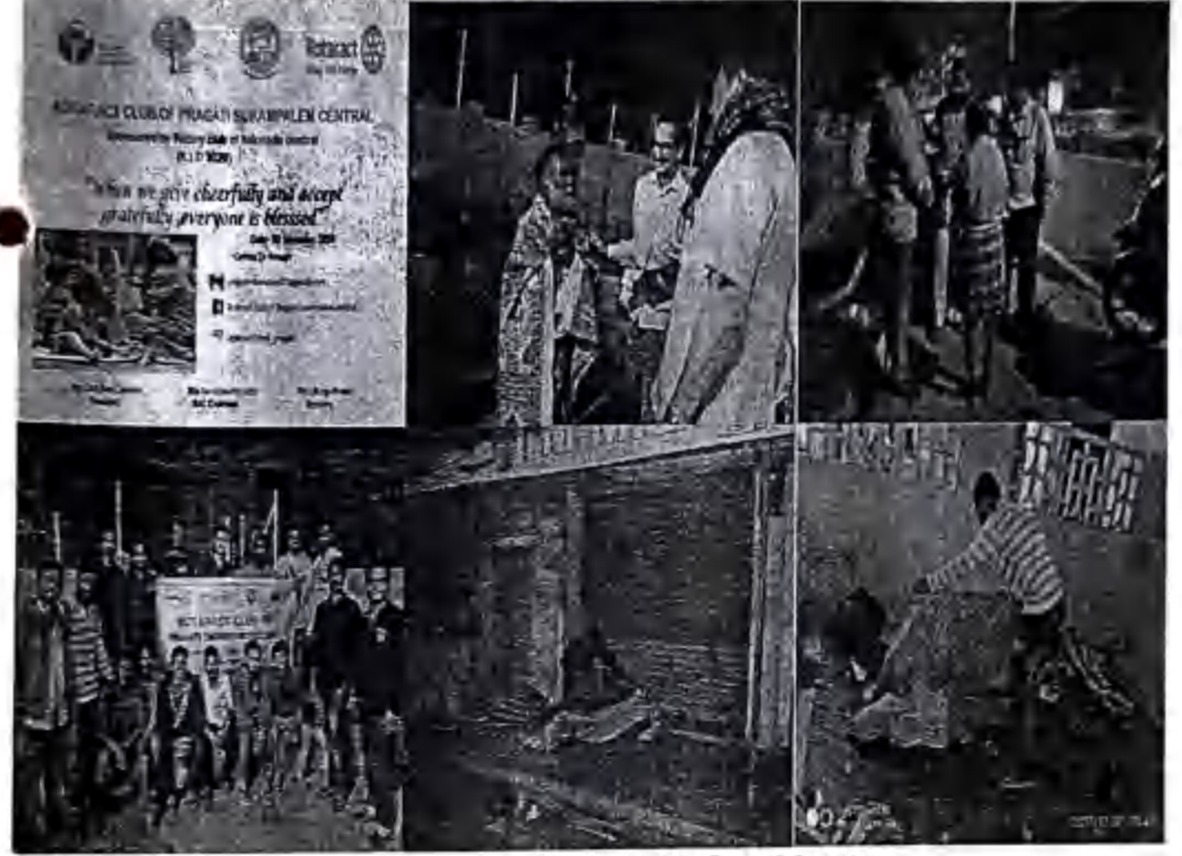
List of participants

Rotaract Club Of Pragati Surampalem Central had distributed 194 blankets overall different places like kakinada,ramachandrapuram,mandapeta,rajamahedravaram,pitapuram,peddapuram,samalkota on same day with help of the sponsors from parent club(Rotary Club of Kakinada Central).