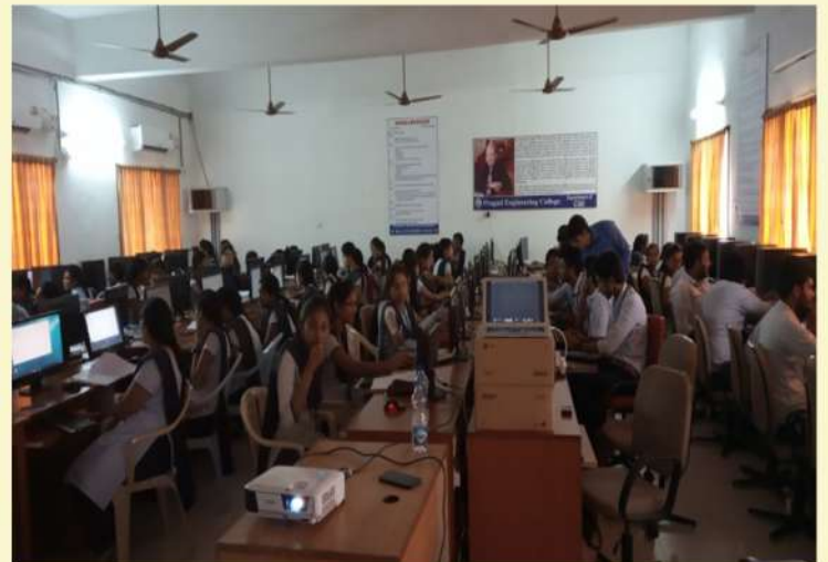
* 18 students from II year and 10 students of III year IT participated in a Two-day workshop on “Progressive Web Application Phase - 1 & 2” in association with APSSDC from 11th to 16th February 2019.