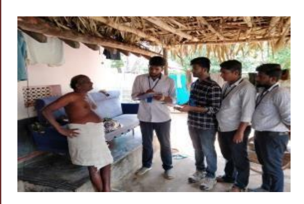
Volunteers knowing about the Health issues of the Households

Due to the Climatic changes and the Unhygienic environment in the village we decided to conduct a Health Survey. In that we have come across many Health issues and Eye Vision is the major problem that got hit that village. So we decided to help the villagers by conducting an EYE Camp.