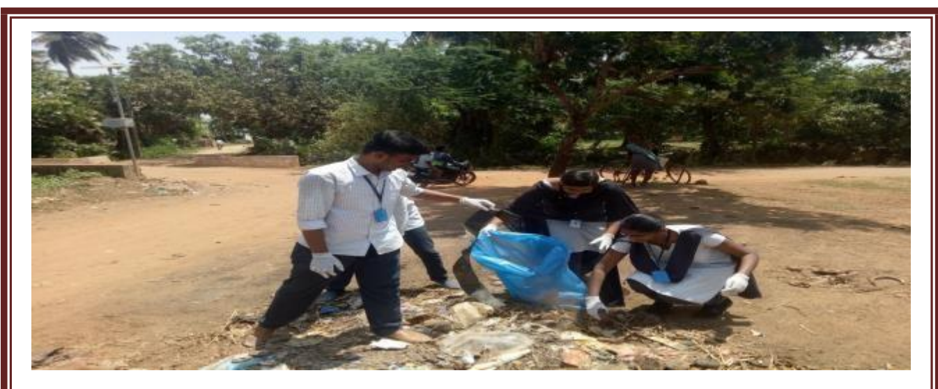
Collecting the waste into Garbage Bags