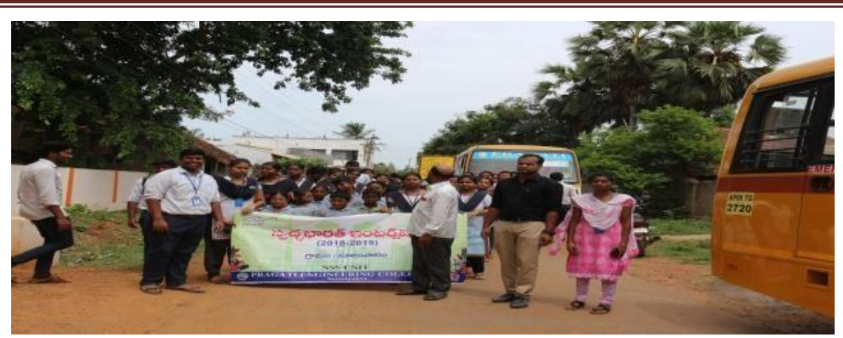
Rally closed at the gates of ZP High School By passing through the streets of K. Surampalem Village

After completion of the Rally, students continued on to their classes. NSS Volunteers applied a Second coat to the two walls simultaneously.