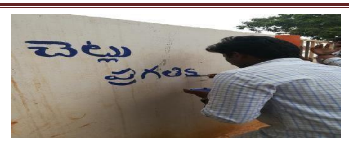
Painting the below Quotation

Allowing the White coat to dry overnight we started to paint the walls with some Motivational Quotes. For the first wall, we painted following quote.