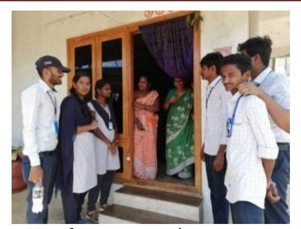
NSS Volunteers creating awareness about the waste around their surroundings