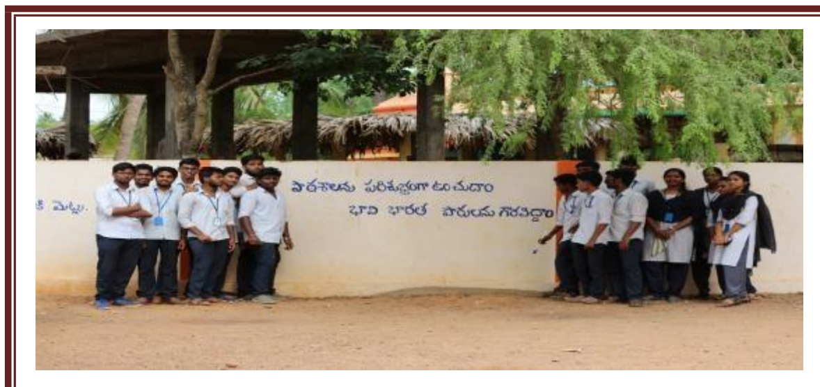
After painting the Second wall