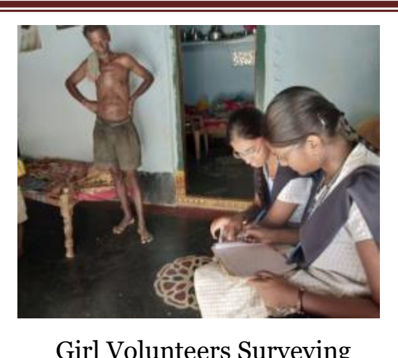
Girl Volunteers Surveying