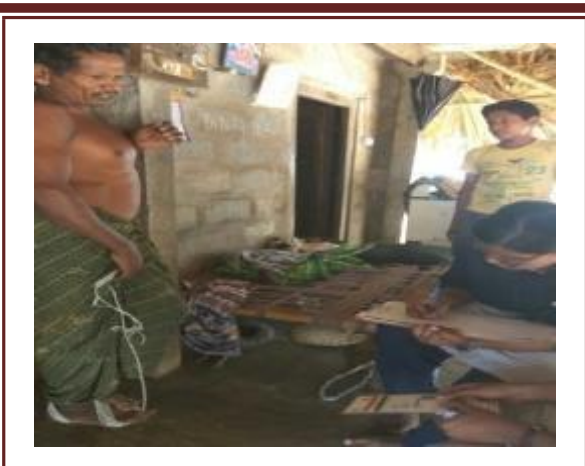
Collecting the details

Half of the village is covered by the end of this day.