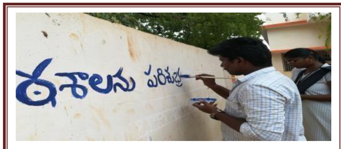
Painting the below Quotation