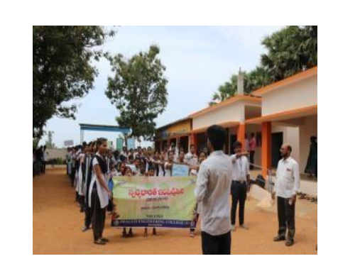
Starting the Rally at ZP High School

After completion of painting we planned a rally with NSS Volunteers along with the Students in the ZP High School which started from school premises itself. The rally went on through the streets of the P. Surampalem Village. Main motto of this rally is CLEANLINESS. The School Students along with NSS Volunteers had given their Slogans regarding CLEAN SURROUNDINGS.