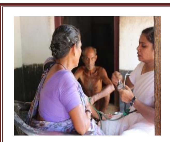
BP Check-up for the villagers