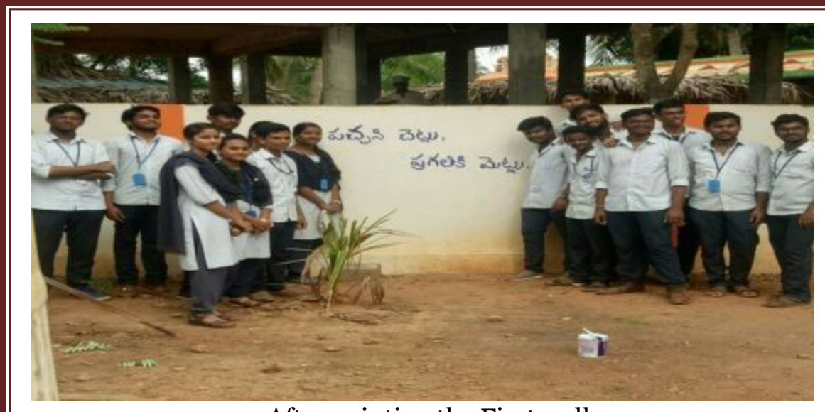
After painting the First wall

After painting the first wall NSS Volunteers started their work for the second wall with a great dedication. For second wall, we painted following quote.